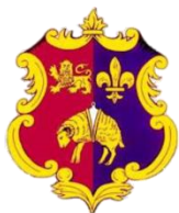
= Tavistock Town Flag