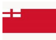
= Red Ensign