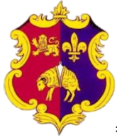
= Tavistock Town Flag