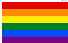
= Pride Flag