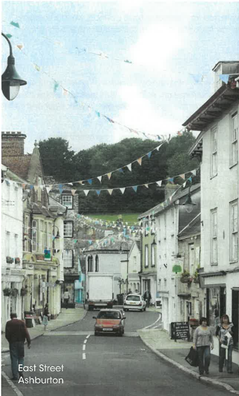
East Street Ashburton

The Local Plan sets out what type of development is and isn't acceptable in the National Park. The Local Plan is our first consideration when we make a decision on a planning application and its policies are likely to affect you, your community, the businesses you use and land in your area.