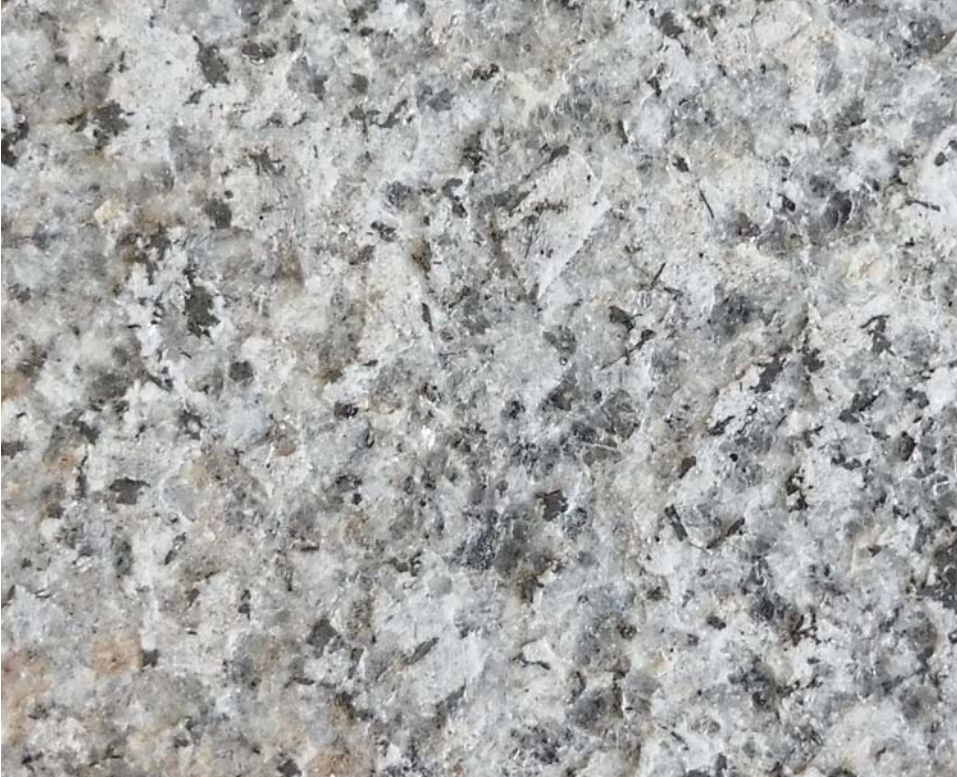
Granite Set Product: Umbriel Colour: Mid/Dark Grey (Sourced from Portugal)

Slip resistant and hard wearing. The resin is suitable for Finish: Flamed both pedestrian and vehicle use.