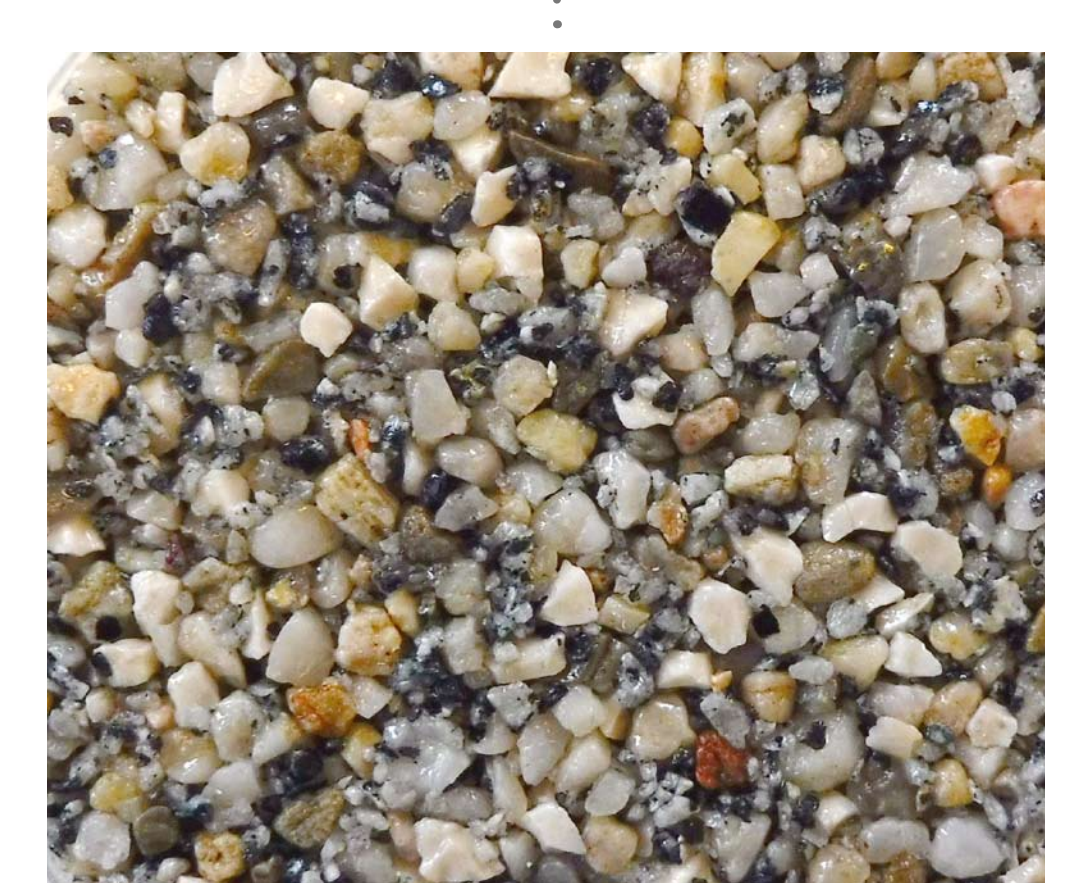
Resin Bound Agregate Colour: "Inverno (UV)"

Bench seating and planter combinations to demarcate central entrance