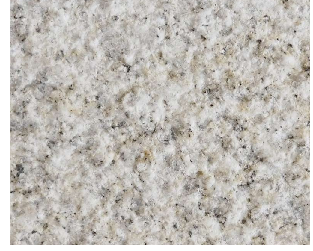
Granite Set Product: Larissa Finish: Fine Picked (Sourced from Portugal)