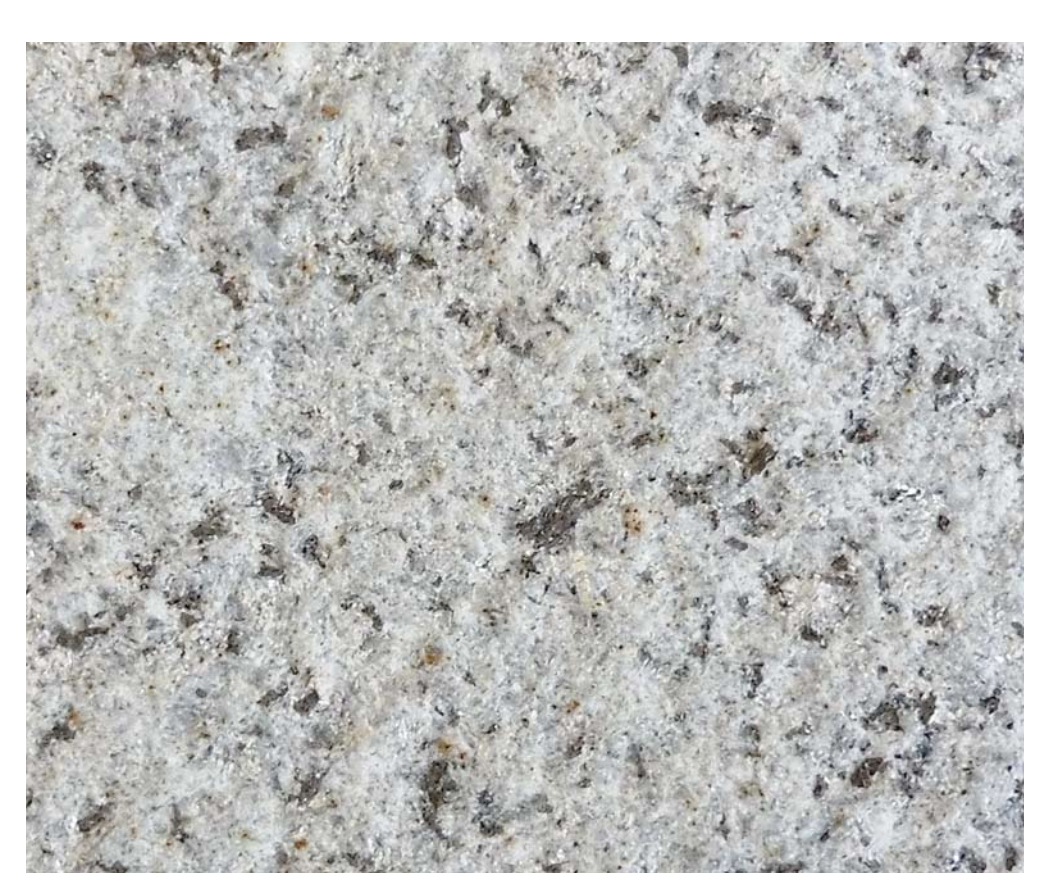
Granite Set Product: Umbriel Colour: Mid/Dark Grey Finish: Blasted (Sourced from Portugal)